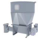
Volumetric metering systems