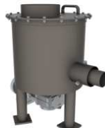
Discharge container with agitator