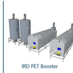
IRD PET Booster